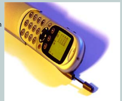
New technology such as camera phones bring concerns for EMS providers.

Let's begin with state laws. The only reference we could come up with is pretty vague. Those of us in management positions that have conducted disciplinary hearings know that one really needs some meat on the