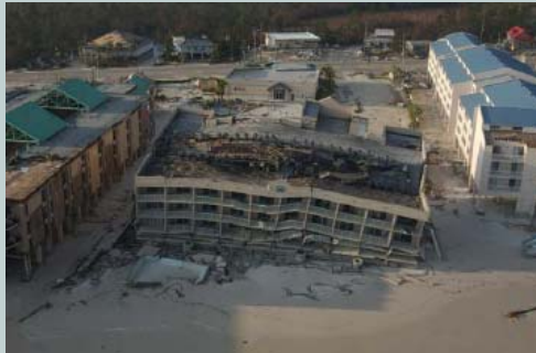
The EMS community played a big role in the Department's success of recent disaster efforts.

Dear Emergency Medical Services (EMS) Colleagues: