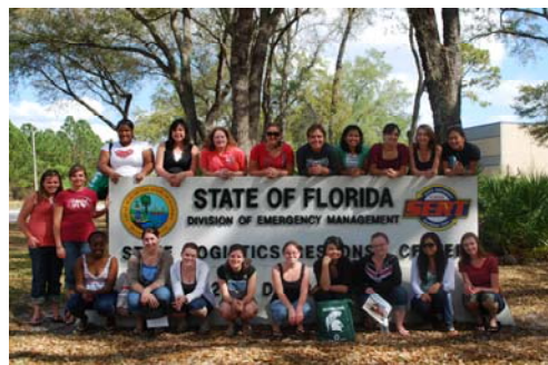
Michigan State University Students

other group of 100 volunteers worked a total of 224 hours this past March to assemble 34,000 kits. Volunteers consisted