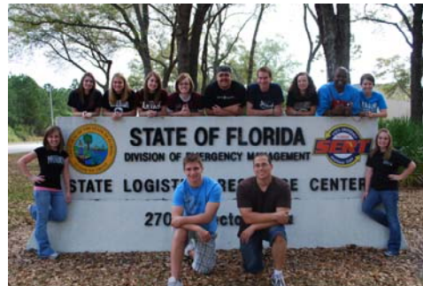
Arkansas Students from Harding University

of Orlando area high school students; Florida, Michigan, and Arkansas college students on spring break; and personnel from AmeriCorps, Volunteer of America, Health Central, Lake-Sumter EMS, Reedy Creek Fire Department, Polk County Health Department, and the Florida Department of